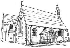
All Saints, Mudeford