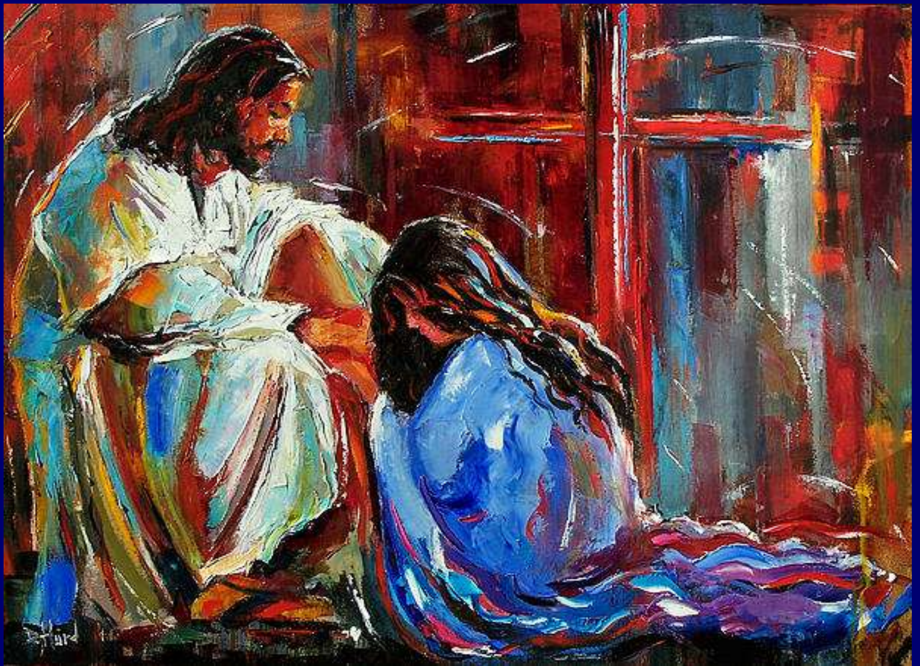
Mary at Jesus' feet