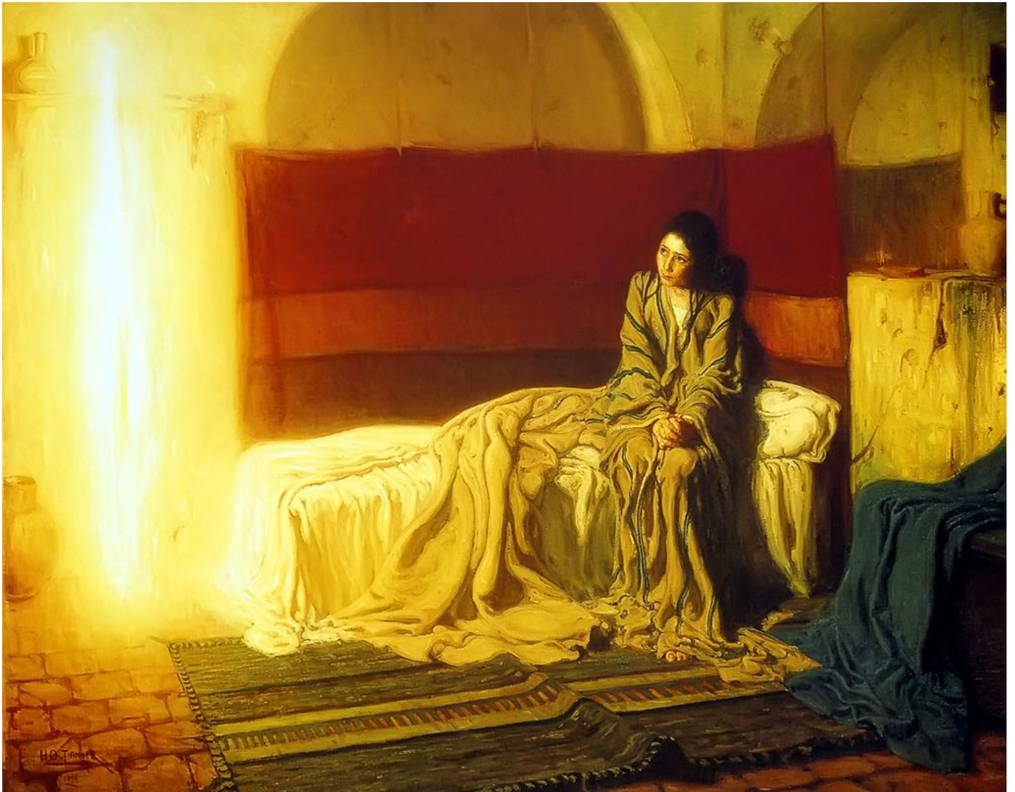
The Annunciation by Henry Ossawa Tanner, 1898

The Word became flesh and dwelt among us, full of grace and truth.